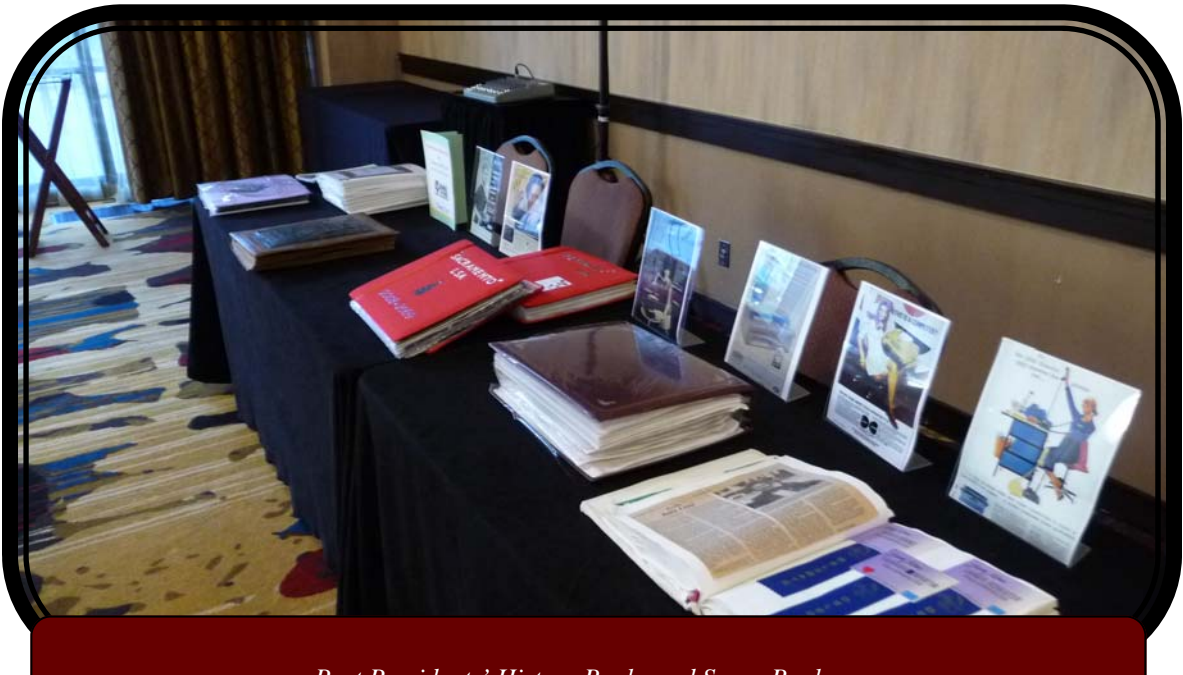
Past Presidents' History Books and Scrap Books