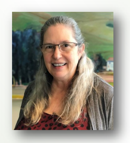
GOVERNOR CORENE RODDER