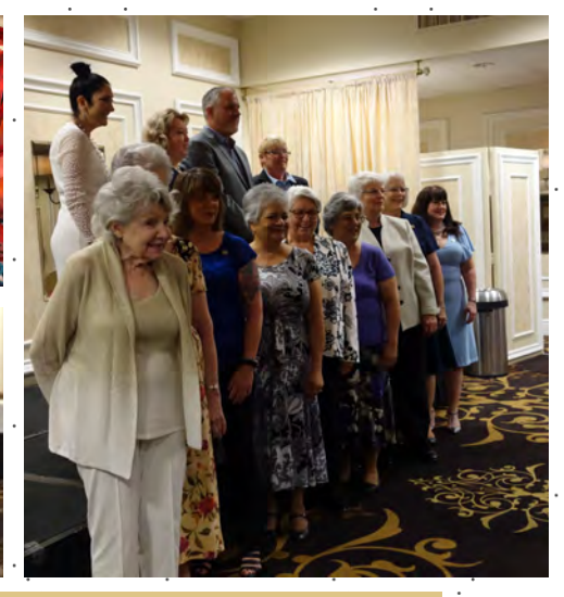
The Legal Eagle